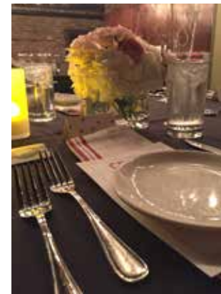
Top two rows: Jiddi Space and Courtyard Bottom row: Downstairs private dining room